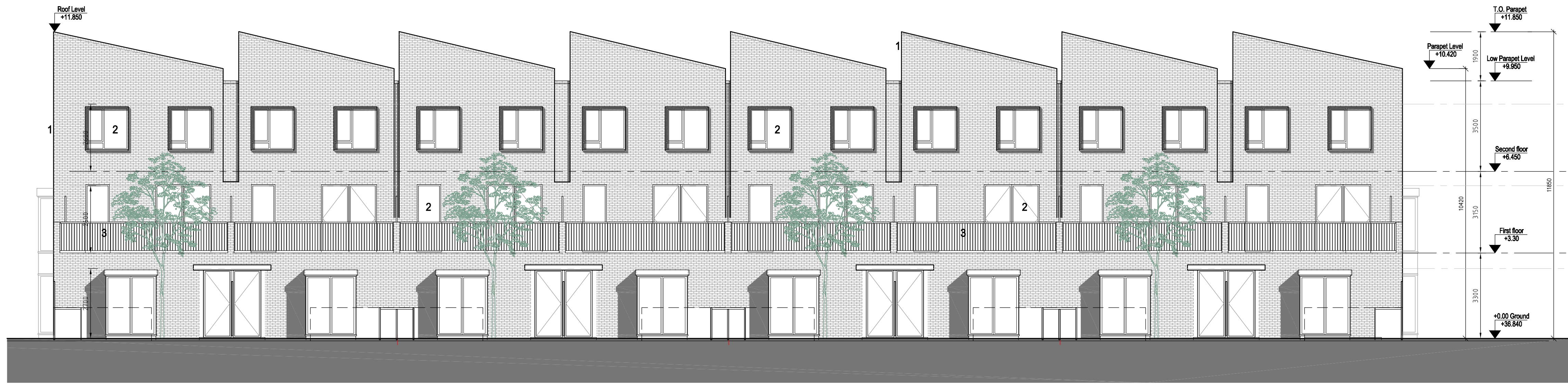
REAR ELEVATION SCALE: 1:100 BLOCK B5 (LANDSCAPING + STORES REMOVED FOR CLARITY)

DRAWING NO. | REVISION 19013-PLA-404 | P1