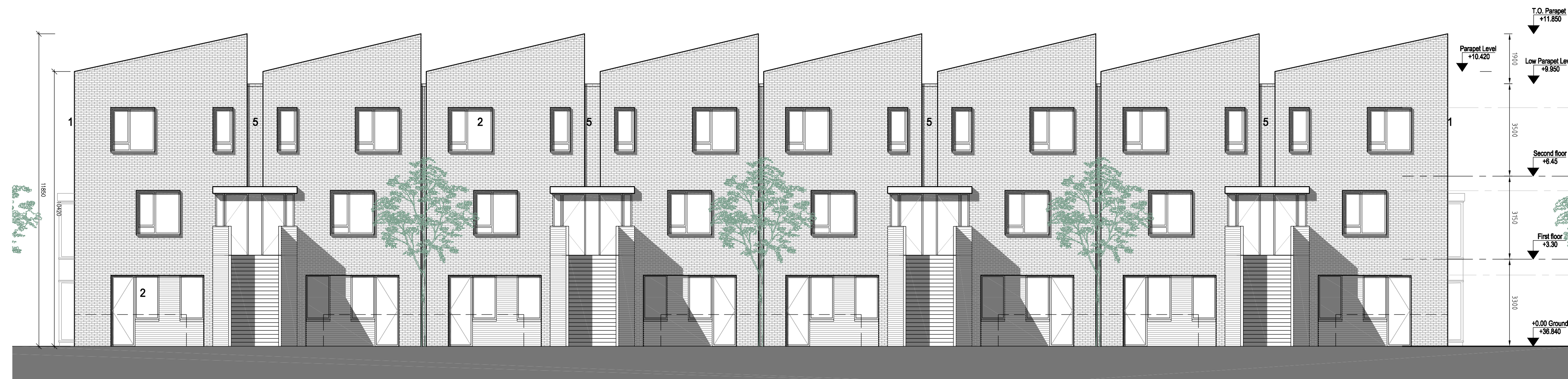
FRONT ELEVATION SCALE: 1:100 BLOCK B5 (LANDSCAPING + STORES REMOVED FOR CLARITY)