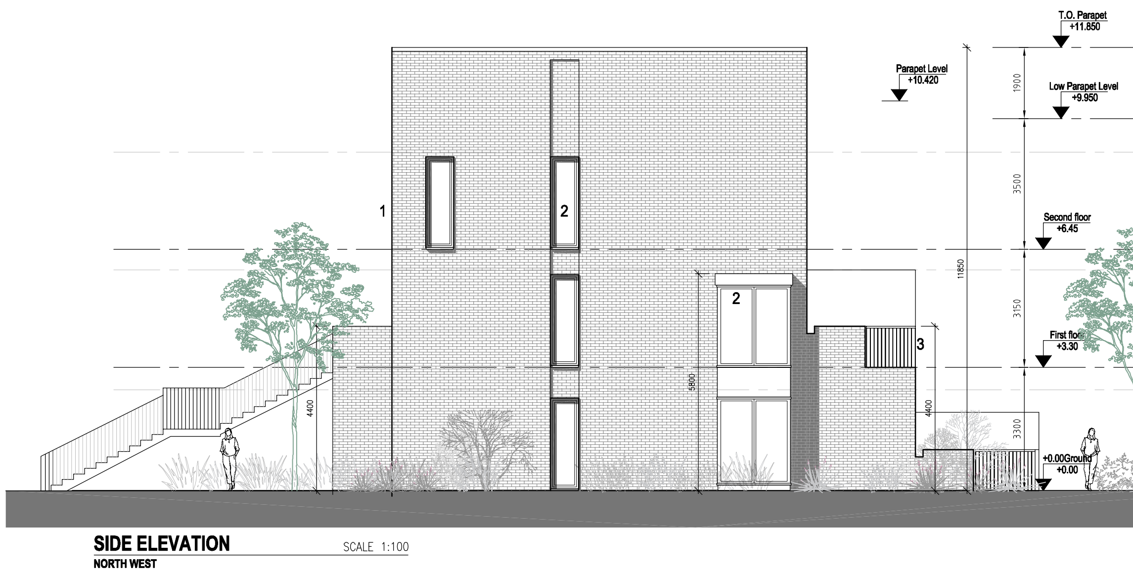
SIDE ELEVATION NORTH WEST