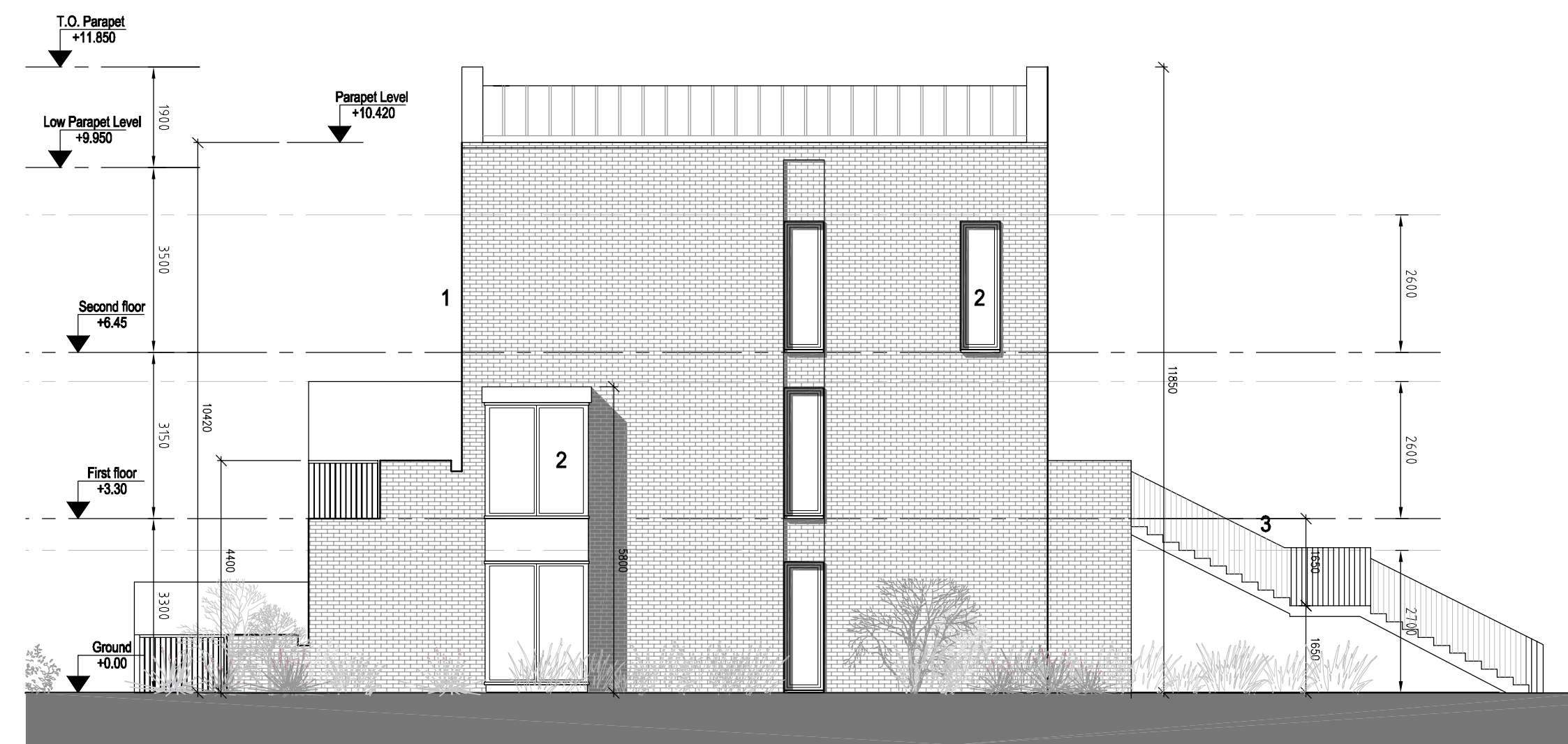
SIDE ELEVATION SOUTH EAST